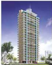
Amrut Angan Kalwa (11 Tower)