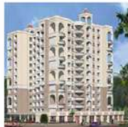
Amrut Park Kalyan (300 Flats)