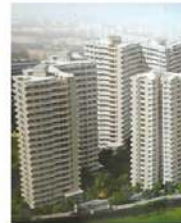
Yogi Dham Kalyan (3o Towers, 200 Flats)