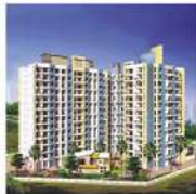
Amrut Heaven Kalyan (300 Flats)