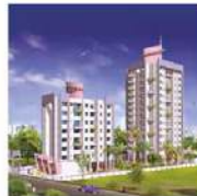
Amrut Palm Kalyan (100 Flats)